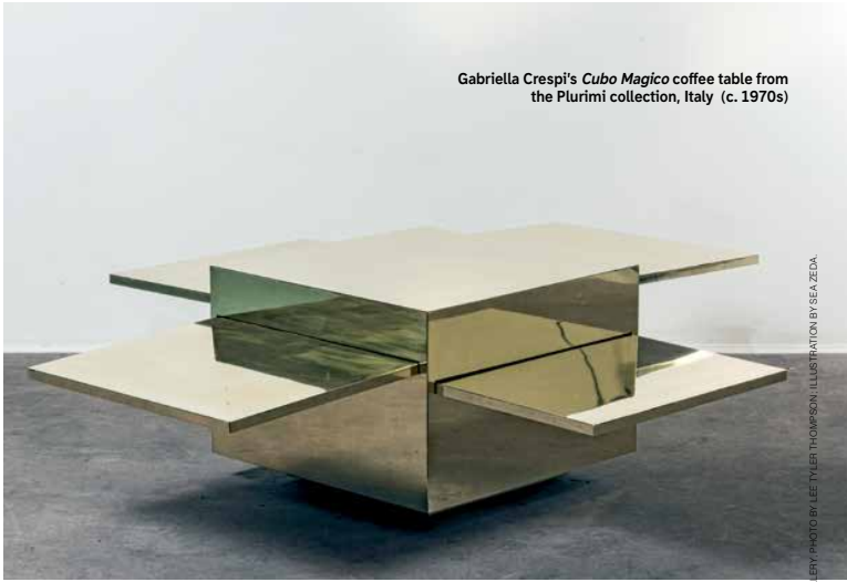
Gabriella Crespi's Cubo Magico coffee table from the Plurimi collection, Italy (c. 1970s)