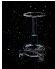
A rendering of Dakota Jackson's 2020 Saturn Stool ; illustration by Sea Zeda

Eight blocks south of the Arts District, the intersection of Olympic Boulevard and Santa Fe Avenue has emerged as the buzziest culture corner in DTLA. Over the past several months, four well-regarded small-to-mid-size contemporary art galleries have taken up residence at 1700 South Santa Fe inside a former tire factory that has been converted into an airy, light-flooded four-story creative campus—a one-stop shop to take in some of LA's most compelling shows at Vielmetter , Nicodim Gallery , Gavlak and Wilding Cran Gallery . VIELMETTER.COM ; NICODIMGALLERY.COM ; GAVLAKGALLERY.COM ; WILDINGCRAN.COM