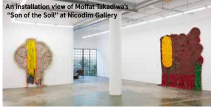
An installation view of Morfat Takadiwa's "Son of the Soil" at Nicodim Gallery

ILLUSTRATION BY SEA ZEDA