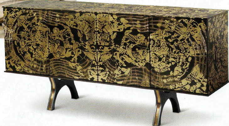
RORSCHACH SIDEBORD CABINET Architectural bronze. Wood interior cabinet inserts are customizable and replaceable hand-painted lacquer resist original artwork with a dark finish. Clear lacquer topcoat. Custom artwork and finishes available.