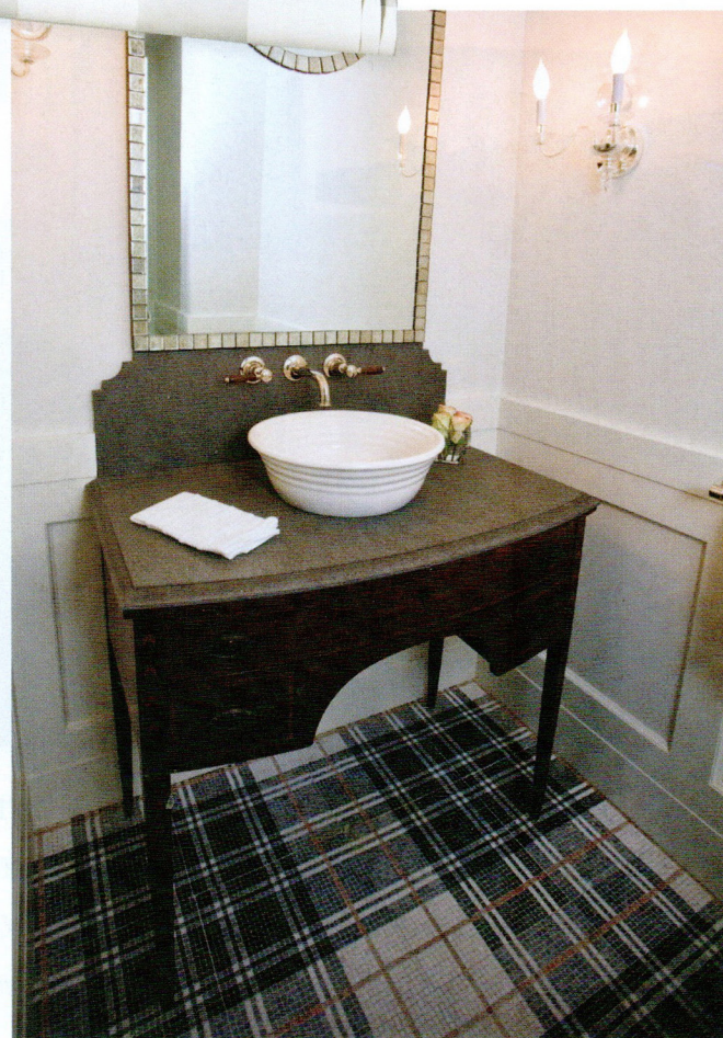
OSCAR BRAVO (LIVING ROOM); BRONSON PATE (POWDER ROOM); LAURA MOSS (OPPOSITE PAGE BATHROOM)