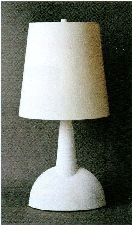
Ceramic lamps by Eric Roinestad of ER Studio are offered by The Future Perfect. erstudiola.com , thefutureperfect.com .