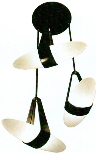
The Sophia Chandelier by Hilliard Lamps debuted at Kneedler-Fauchere during WestWeek in March. kneedlerfauchere.com , hilliardlamps.com