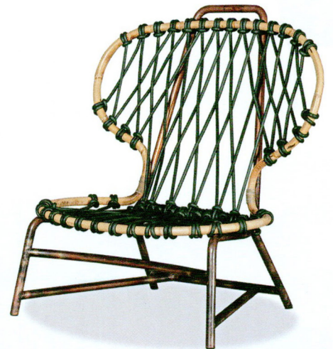
The Manila outdoor chair from Baxter was introduced at Salone in April and will be available through DDC. ddcnyc.com , baxter.it .