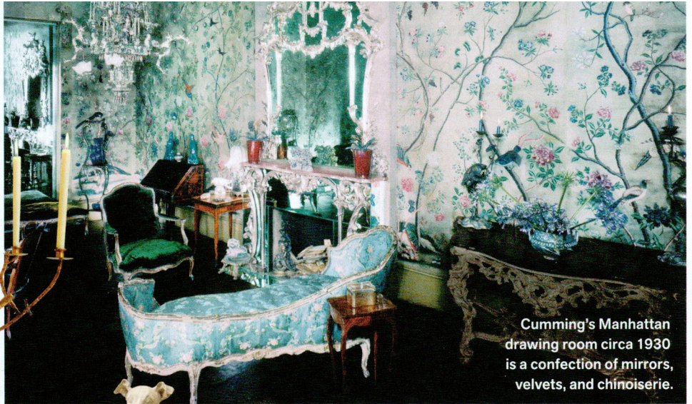
Cumming's Manhattan drawing room circa 1930 is a confection of mirrors, velvets, and chinoiserie.