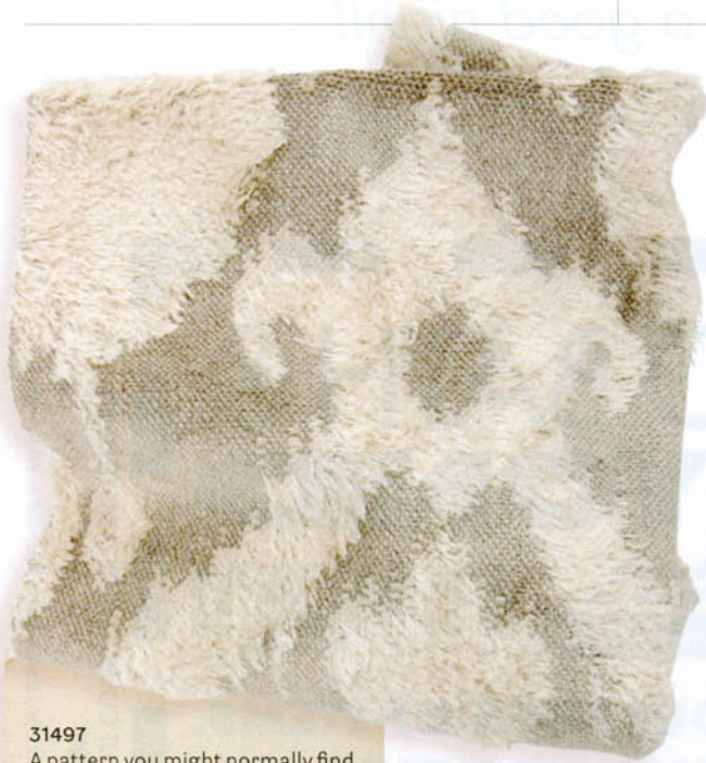
31497 A pattern you might normally find in an ikat, reinterpreted as a fuzzy shag. Viscose blend in Color 16. kravet.com .