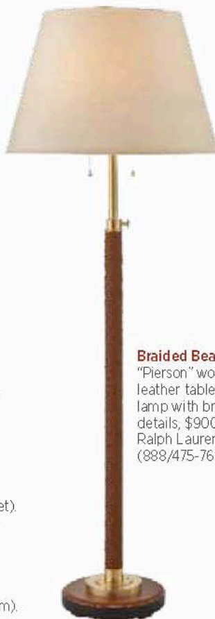
Braided Beauty "Pierson" woven-leather table lamp with brass details, $900; Ralph Lauren Home (888/475-7674).