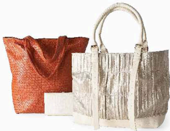
Bag It Orange woven-leather tote, $495; Christopher Kon through Carleen Ligozio (631/204-0104). White, faux-croc patent full-frame clutch, $128; Abas (abas.net). Pleated, platinum lambskin tote, $595; Nanette Lepore through Zappos Couture (zapposcouture.com).

"We've transformed the leather from its original state of a full, heavy hide into a new material that delicately drapes like fabric," he explains. "So the end product has the feel and smell of leather, but behaves more like a textile." Since prehistoric times, history may have clung to leather's practical durability, but the future likes its new look. ➤