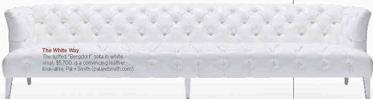
The White Way The tufted "Bergdorf" sofa in white vinyl, $5,700, is a convincing leather-look-alike; Pal + Smith (palandsmith.com).