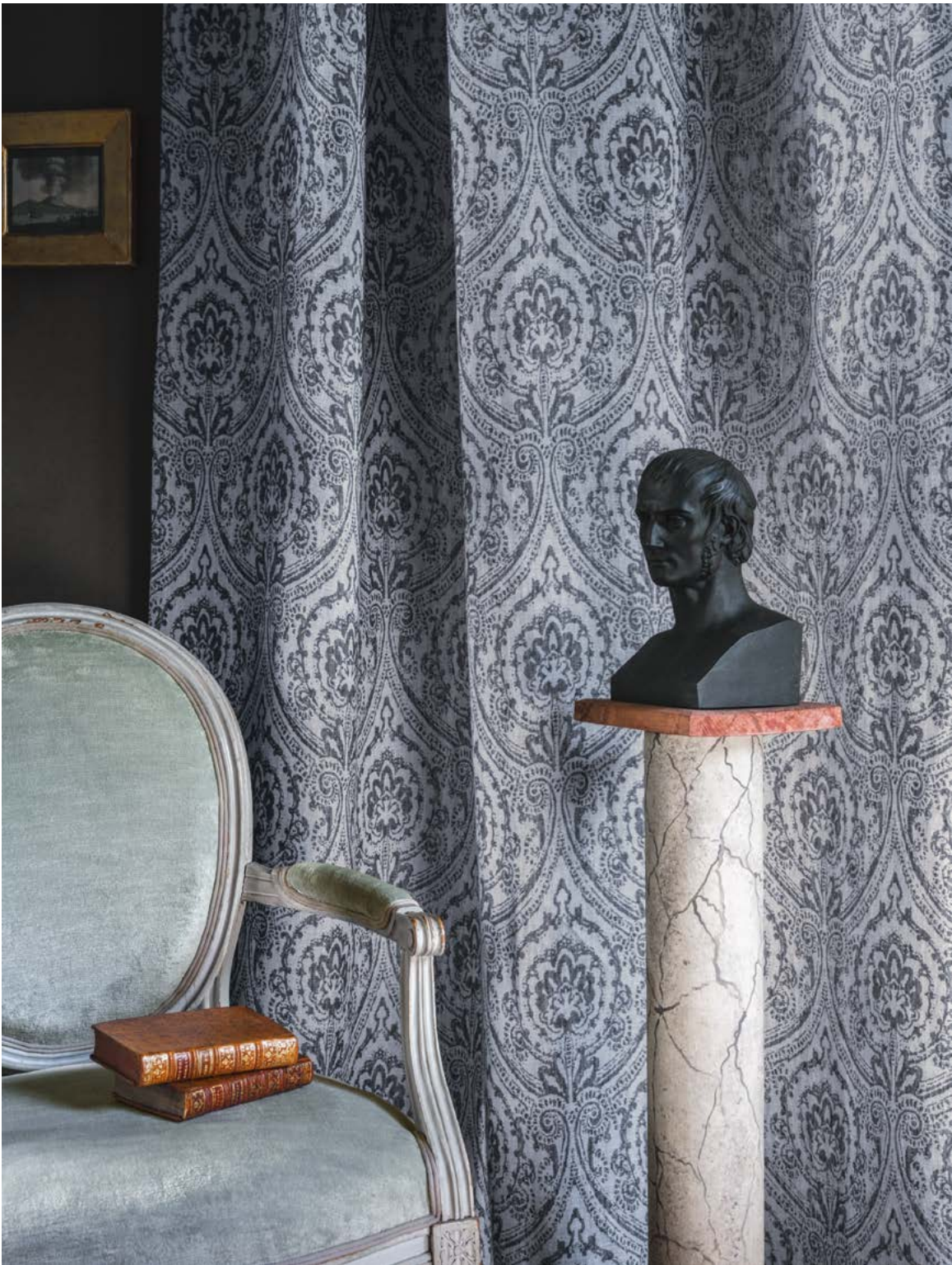
JOSEPHINE The reinterpretation of the classic damask motif as a semi-transparent double weave adds summery lightness to the decorative all-over design.