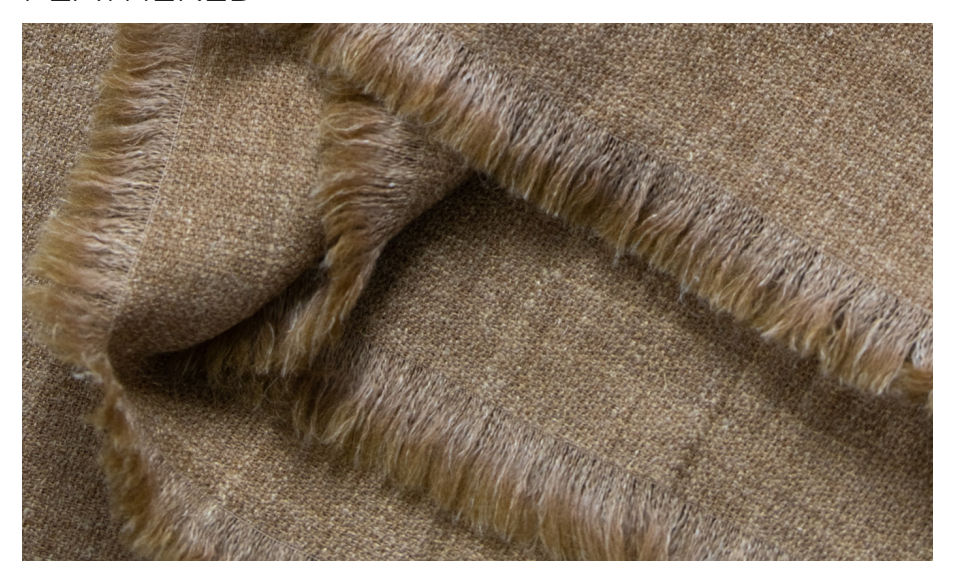
With no hem, the feathered finish maximizes the ombré effect.