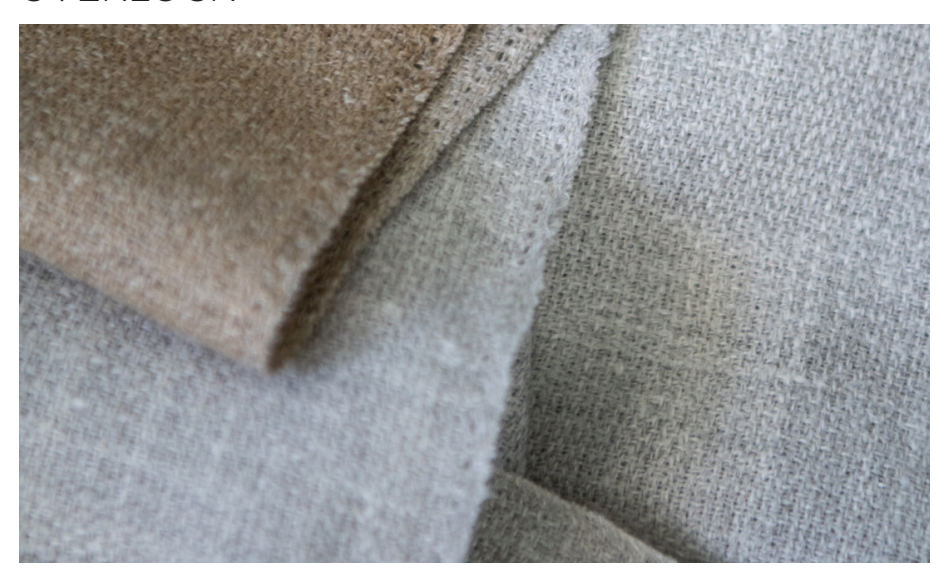
For a hemmed edge choose an overlock finish.