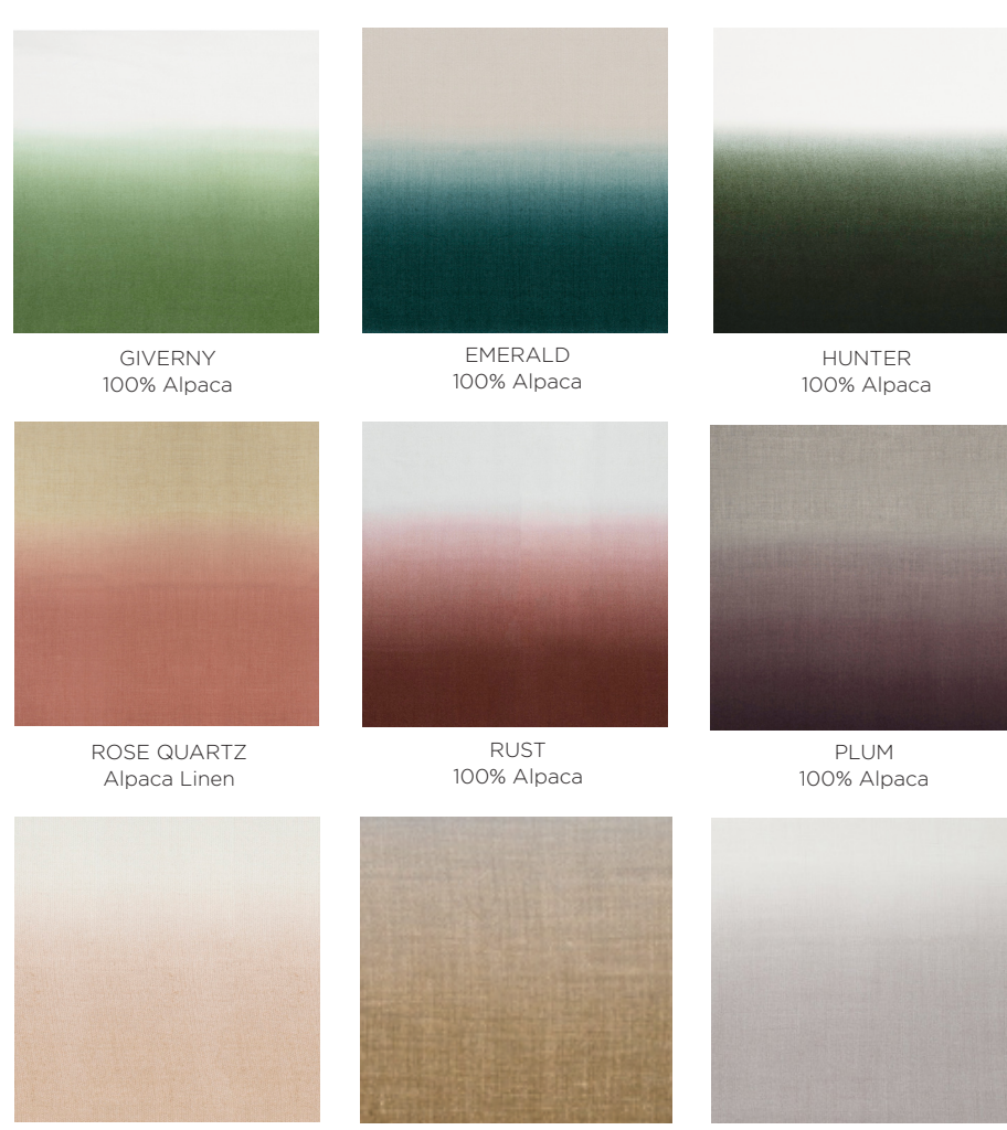
OAT GOLD 100% Alpaca Alpaca Linen