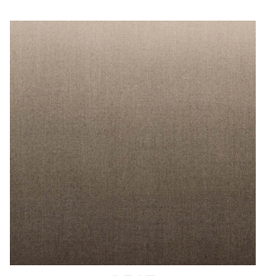
PEAT 100% Alpaca