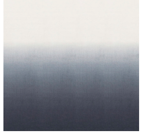
WHALE 100% Alpaca