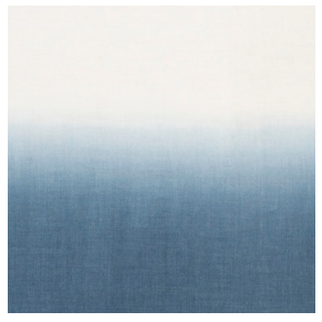
BREAKERS Alpaca Linen