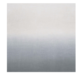
ZINC Alpaca Linen