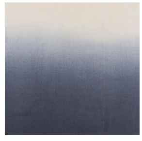
MALIBU 100% Alpaca