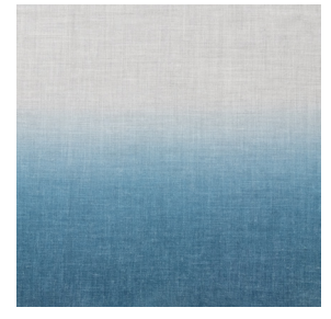
AEGEAN Alpaca Linen NEW