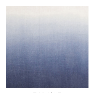
TWILIGHT Alpaca Linen