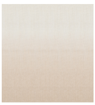
oat ombre new