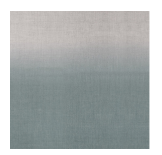
SUMMER'S DAY Alpaca Linen