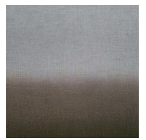
PINE BARK Alpaca Linen