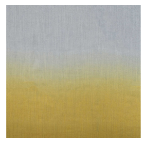
CANARY Alpaca Linen