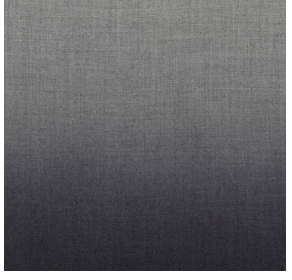
GRAPHITE 100% Alpaca