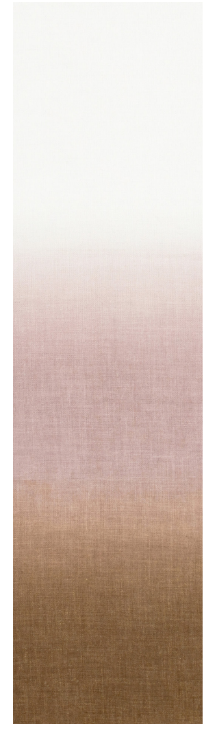
AURORA BYZANTINE PARFAIT