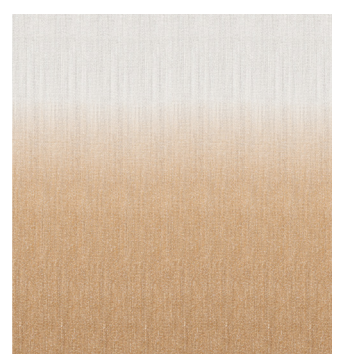
GOLD OMBRE NEW