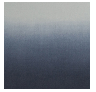
NAVY 100% Alpaca